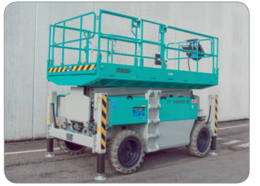
Compact dimensions (2.20x3.92 m).